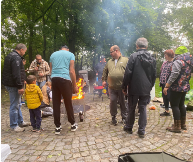
▲ Members of ZOD Rhein-Main at barbecue