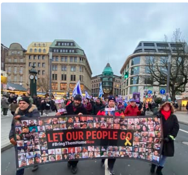
▲ "Run for their Lives" in Düsseldorf over 40 weekends

The members and friends of ZOD in Düsseldorf, Frankfurt, and Munich organized over 20 individual