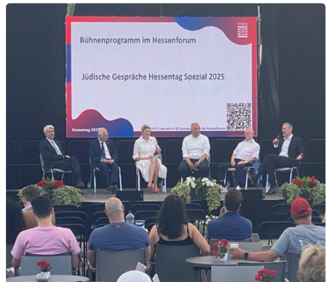
▲ Jewish Conversations - Hessentag Special, Summer 2025, with several hundred visitors.

As part of Hessentag 2025 in Bad Vilbel, a special edition of "Jüdische Gespräche" (Jewish Conversations) took place on the Hessenforum stage. The public panel brought together representatives of Jewish life in Hesse alongside political and civic leaders for